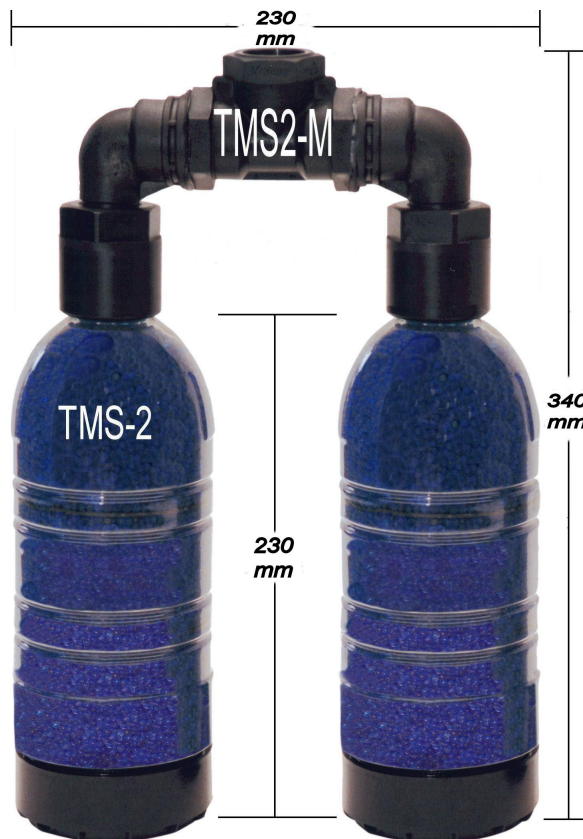
2 x TMS-2 + TMS2-M 2 x Replacement cartridges + 2-way manifold