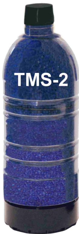
TMS-2 Replacement Cartridge Bottles are PET