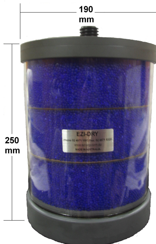
TMS-10 Base & Top Grey PVC & Plexiglas XT