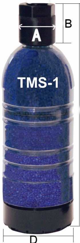
TMS-2 + Adaptor = TMS-1