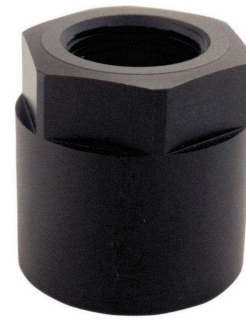
TMS001 Adaptor 3/4 " BSP thread CNC Acetal