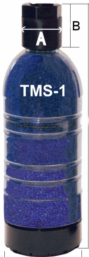
TMS-2 + Adaptor = TMS-1