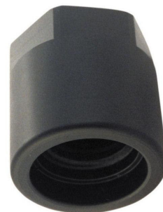
TMS001 Adaptor \frac{3}{4} " BSP thread CNC Acetal