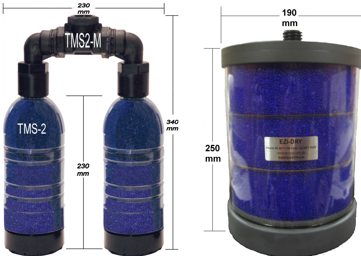
2 x TMS-2 + TMS2-M 2 x Replacement cartridges + 2-way manifold